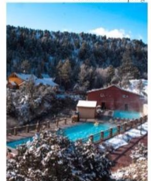
Mt Princeton winter