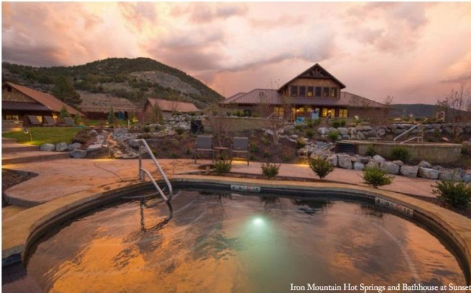
Iron Mountain Hot Springs and Bathhouse at Sunset