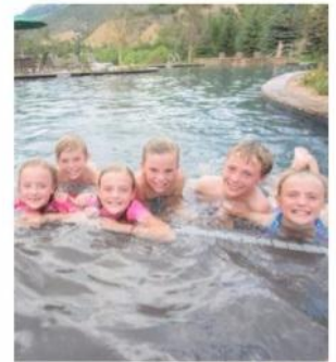
Big Smiles in the Family Pool at Iron Mountain Hot Springs